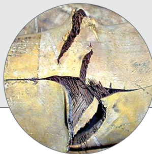
Excessive Cover Damage